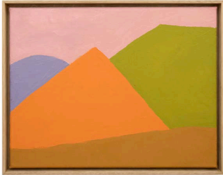
Etel Adnan, 'Untitled,' 2018.

The rise of older women artists has largely been possible thanks to a growing infrastructure of curators, collectors, gallerists and writers that recognize the ubiquity of white, male, Euro-centric art and the unexplored richness of the work that exists—and has long existed—outside the canon. But their more recent success would also not be possible without a public interested in diverse voices (as well as a public interested in identifying and worshipping heroes who "nevertheless persisted"). While the fact that these women are getting such a late due does warrant a cynical response, that response misses the positive shifts implicit in their success. From top to bottom, the world is becoming the audience they have deserved all along.