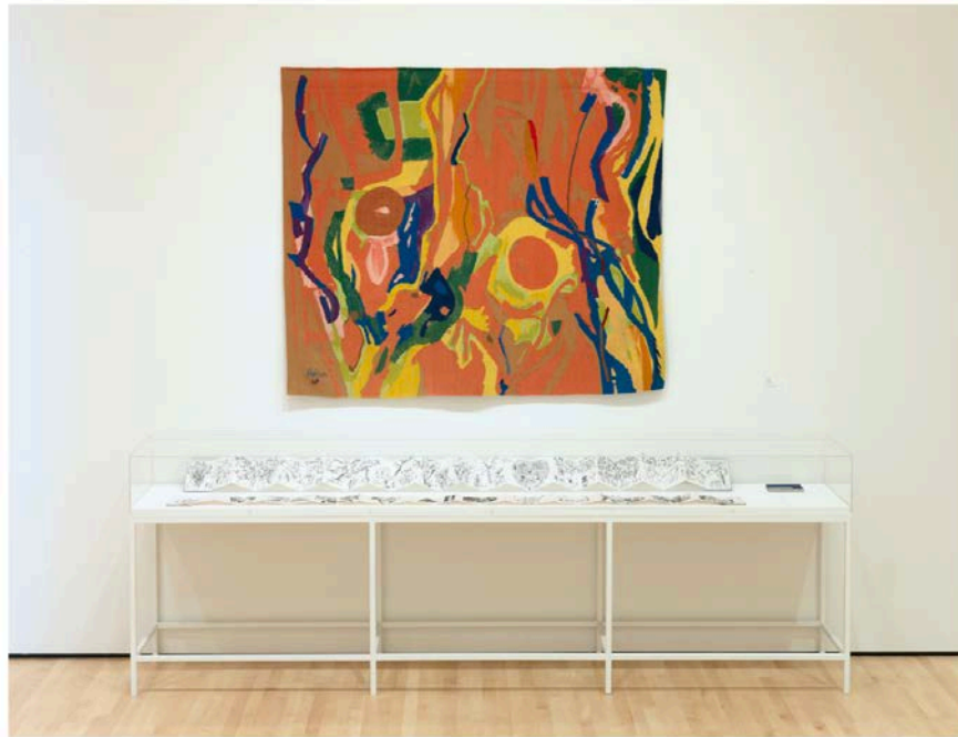
Etel Adnan, Installation view of 'New Work,' 2018.

The exhibit's showstopping pieces are two tapestries conceived at the same time but executed decades apart. Untitled from 1968 is a Kandinsky-like flurry of blues, yellows and greens against a crimson red backdrop. It buzzes with energy against the wall but loses its cohesion in the thrum of its own busyness.