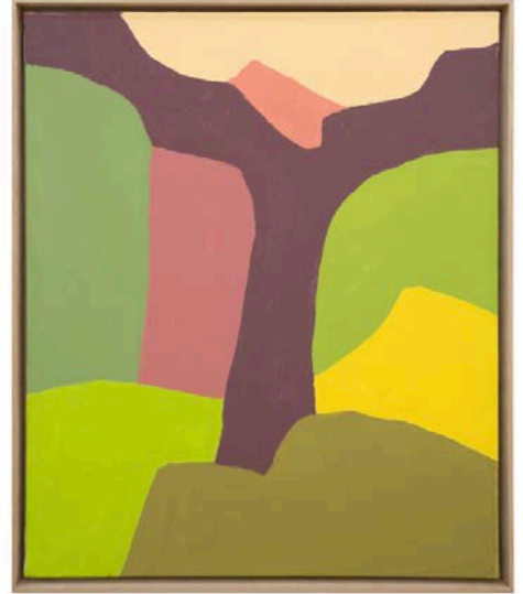
Etel Adnan, 'Untitled,' 2018.

Elsewhere Adnan litters her fields of color with a bevy of familiar shapes: lunar circles, cragged mountains and triumphant squares. Some paintings are bisected by these figures, achieving a similar effect to the T-shaped works, in which every tone converses harmoniously with its fellows. Perhaps there's such a thing as too much harmony, however; in some of these "shape" paintings, Adnan's flirtation with too-similar colors neutralize rather than excite.