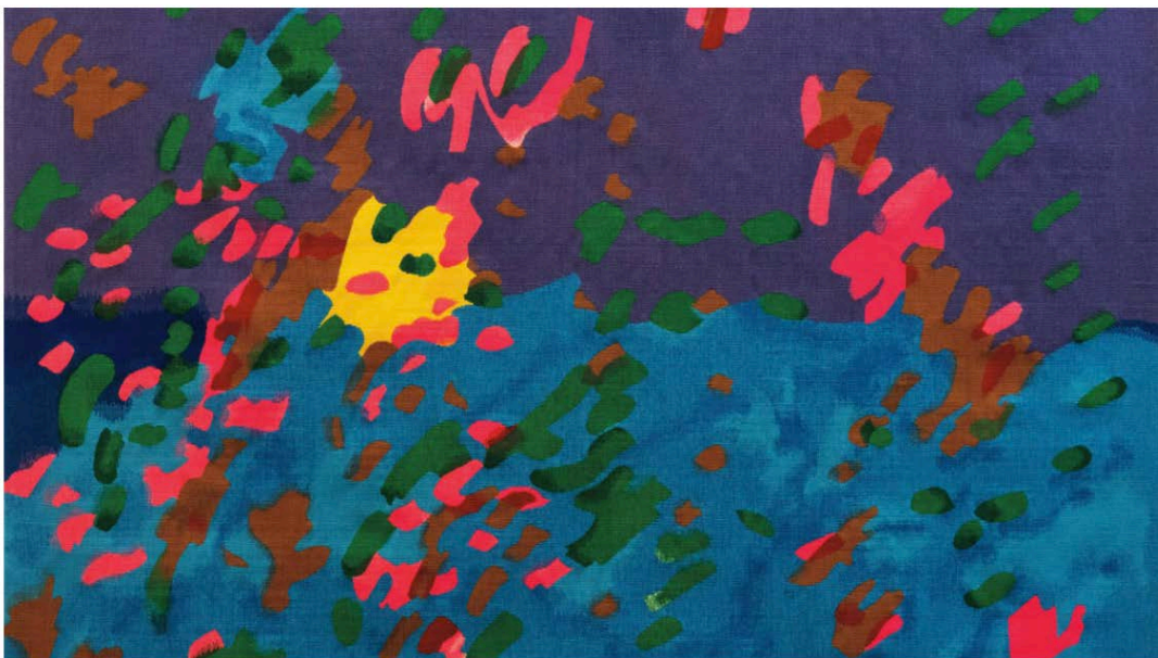
Etel Adnan, Detail from 'Explosion Florale,' 1968/2018. (Courtesy the artist and Sfeir-Semler Gallery Hamburg / Beirut)

One of the most exciting recent developments in art has been the critical and commercial resurgence of female artists in their senior years. Working for decades at the industry's margins or completely outside of its closed system, older women are not only headlining shows and commanding impressive sales, but complicating and enriching established ideas about art.