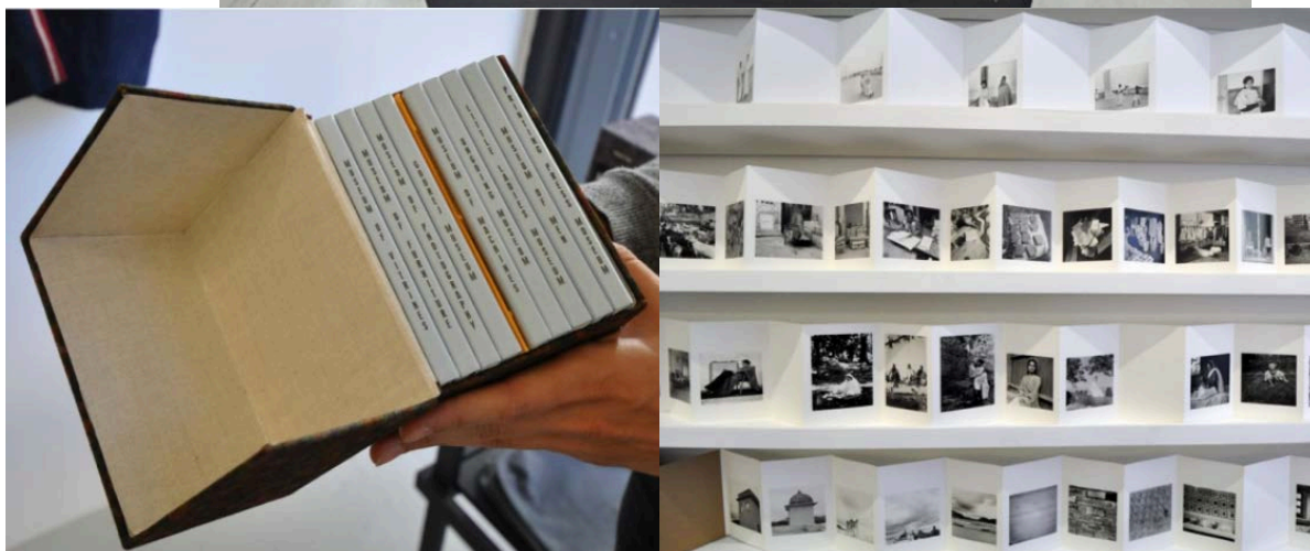
Views of Dayanita Singh's "book object" mini-retrospective at Callicoon Fine Arts