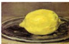
Edouard Manet, Le citron , 1880. Courtesy: Musée d’Orsay, Paris. Bequest of comte Isaac de Camondo, 1911

In the early 1800s in Germany, a follower of Goethe’s experimental attitude, Friedlieb Ferdinand Runge, changed the world. Fooling around with coal tar, a derivative of the industrial processing of coal that was up to then thrown away, he produced the first chemical color to be synthesized from carbon fossil fuel. He called it cyan blue, and it was aniline. It was a color made out of dark brown, made from tearing carbon fossil from the bowels of the Earth—a kind of magic proving the unstoppable progress of science. He published his book of chemical color experiments, Der Bildungstrieb der Stoffe (The Formative Tendency of Substances), in 1855. Walter Benjamin expert Esther Leslie (Benjamin color-coded his thoughts and notebooks well before highlighters were invented) wrote about this in 2005, suggesting how the chemical turn of the nineteenth century ushered in a positivistic blind faith in modernity’s ability to harness the universe through science—we could make anything artificially, virtually any color in the natural world. 1 This blind faith in progress and science ultimately transformed into