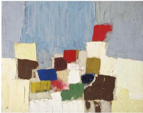
Top - Etel Adnan, Soleil Carré , 1989. © Etel Adnan. Courtesy: Galerie Lelong, Paris / New York