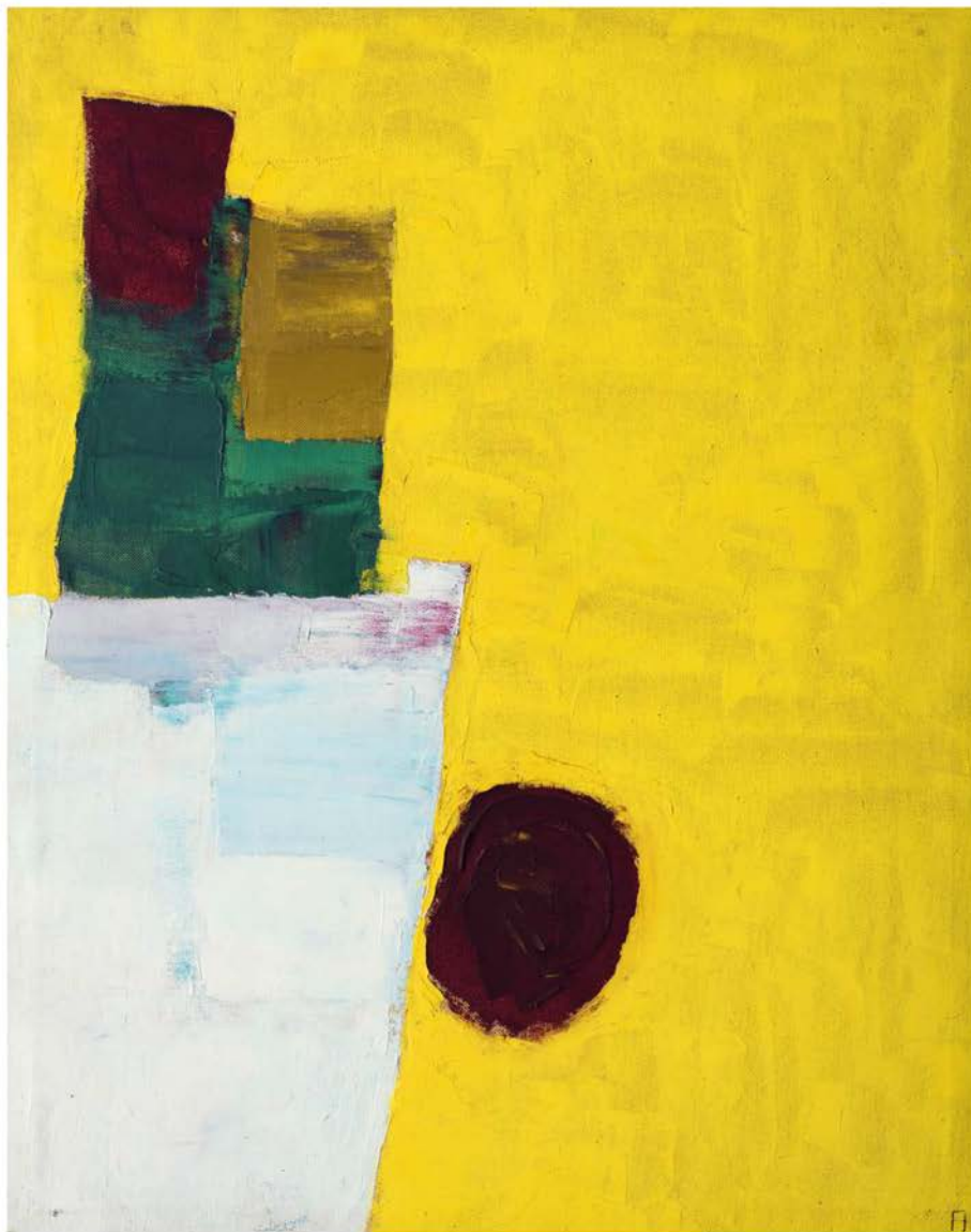
Etel Adnan, Cactus , ca. 1980. © Etel Adnan. Courtesy: Galerie Lelong, Paris / New York