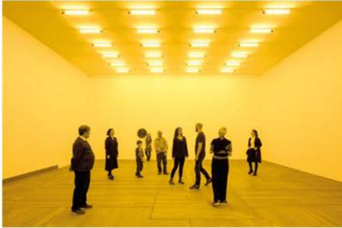
Above - Olafur Eliasson, Room for one colour , 1997, installation view at Moderna Museet, Stockholm, 2015. © 1997 Olafur Eliasson.