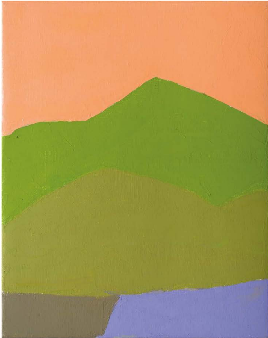
Etel Adnan, Landscape , 2016. © Etel Adnan. Courtesy: Galerie Lelong, Paris / New York