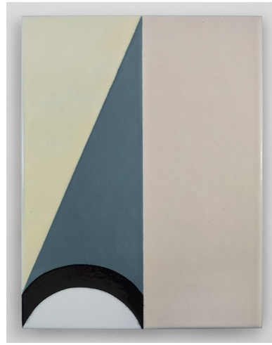
Ulrike Muller - Weather, 2013

Vitamin P3 New Perspectives In Painting is the third in an ongoing series that began with Vitamin P in 2002 and Vitamin P2 in 2011. For each book, distinguished critics, curators, museum directors and other contemporary art experts are invited to nominate artists who have made significant and innovative contributions to painting. The series in general, and Vitamin P3 in particular, is probably the best way to become an instant expert on tomorrow's painting stars today.