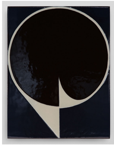
Ulrike Muller - Others, 2015 courtesy the artist and Callicoon Fine Arts