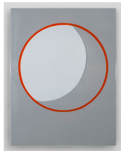
Ulrike Müller - Weather, 2013 courtesy the artist and Callicoon Fine Arts